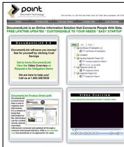
The www.documentlink.net Home Page

The www.documentlink.net site provides details about DocumentLink™ through a number of mediums in order to highlight various aspects of the application. The site features a video overview that discusses the question